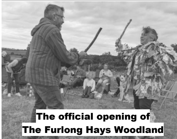
The official opening of The Furlong Hays Woodland